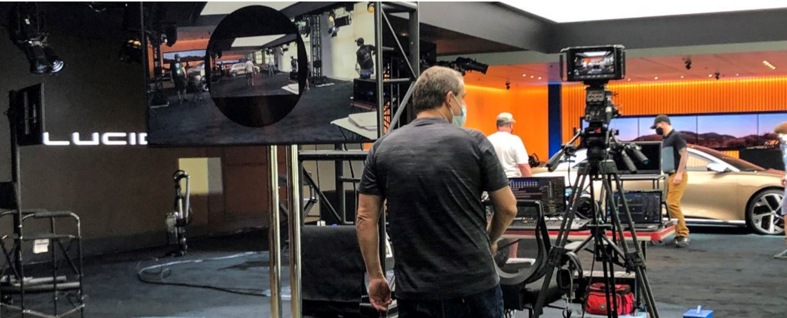
MC 2 | "The Lucid Air"

In the Live Marketing Solutions (LMS) division, a total of 1,124 projects were supervised in the reporting year, 130 of which were in Switzerland and 826 in the USA. In terms of numbers, this is about 30 % of the projects handled the previous year.