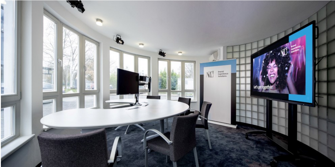
MC 2 Europe | Studio for video calls