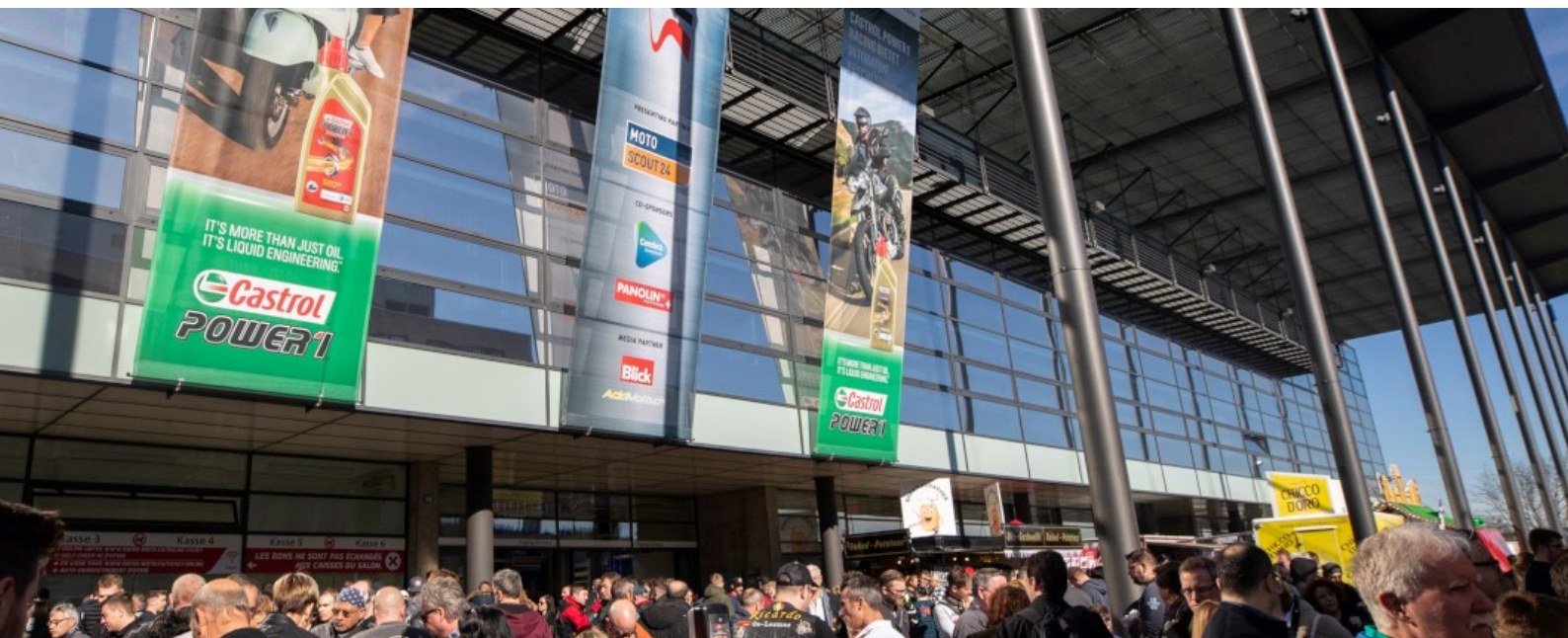
Messe Zürich | SWISS-MOTO

At Messe Basel, Swissbau was the only one of seven scheduled MCH exhibitions that could be held. Details of the MCH exhibitions are included above. Of the nine third-party exhibitions that had been planned, only blickfang, which had been postponed to October, was able to take place. All other third-party exhibitions had to be cancelled, including AUTO/MOBIL Basel, FANTASY Basel and the Basel career and training fair. In the case of hall rentals too, most events had to be cancelled. Areas of Hall 2 were made available to the Basel theatre for rehearsals for just under three months. The go-cart track in Hall 1 – the biggest indoor go-cart track in Switzerland – had to cease operating after a few weeks on account of the Covid-19 protection measures introduced.