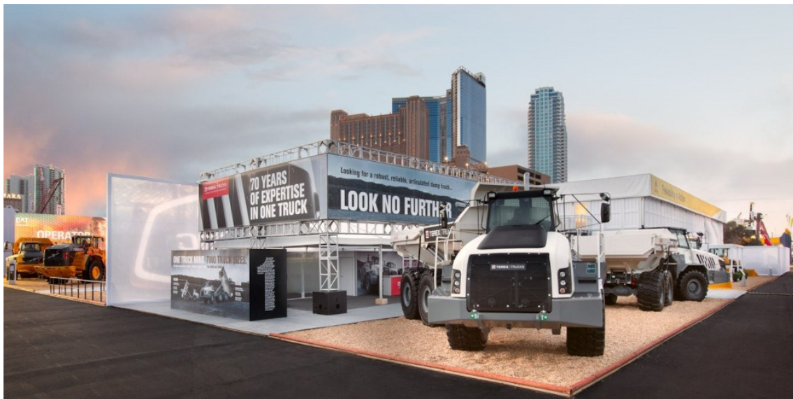
Volvo | CONEXPO