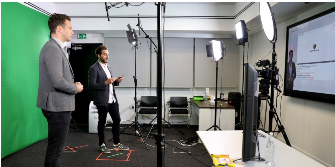
Porsche | Virtual Summit