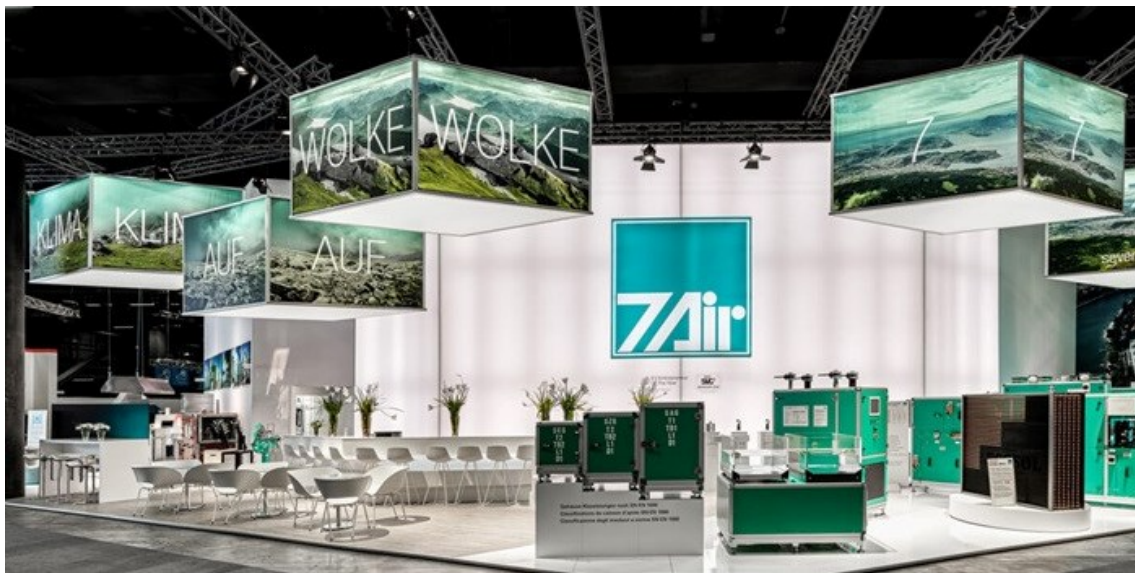
7AIR | Swissbau 2020