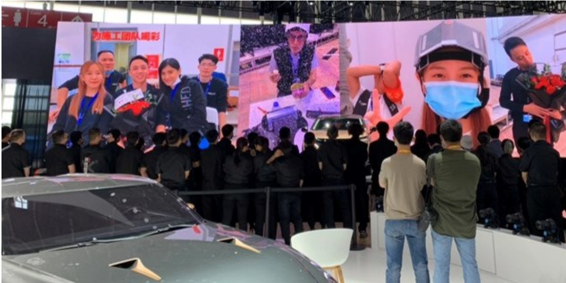
Nissan | Beijing Motor Show