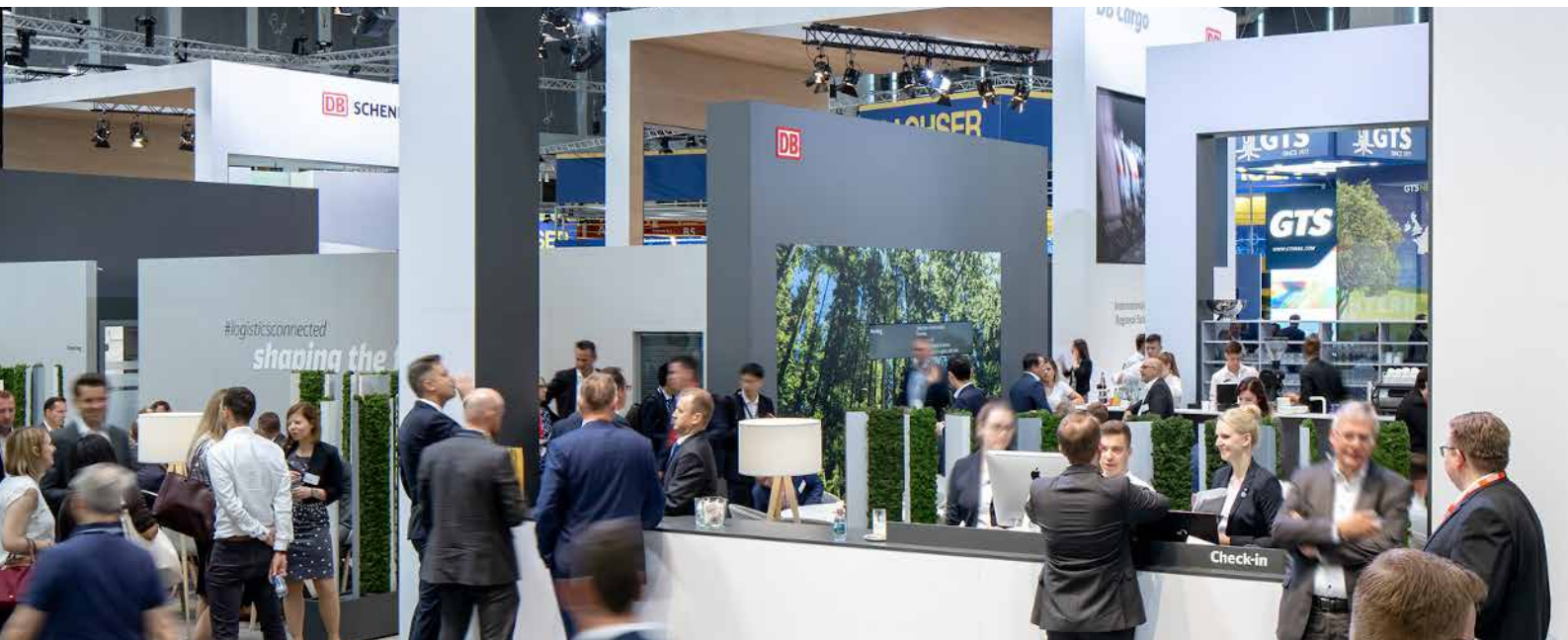
MC 2 Europe – DB – transport logistic

The range of events supervised by the Live Marketing Solutions division included corporate events, such as trade fair participations, roadshows and annual general meetings, and also public events in the fields of culture, sport and society. The MCH companies provided comprehensive services here in the fields of strategy and concept and also implementation.