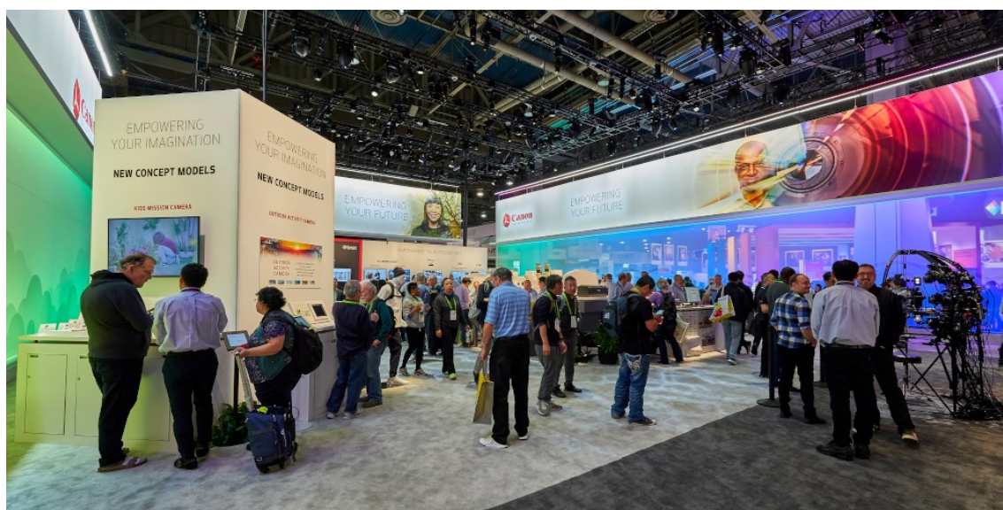
MC 2 – Canon – CES

1) Australia, Canada, China, Germany, Indonesia, Ireland, Malaysia, Mexico, Netherlands, Norway, Peru, Singapore, Spain, UAE, UK, Vietnam