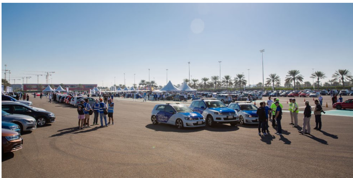
MCH Global – VW Dub Drive – Dubai

1) Austria, China, Great Britain, Hong Kong, UAE, USA,