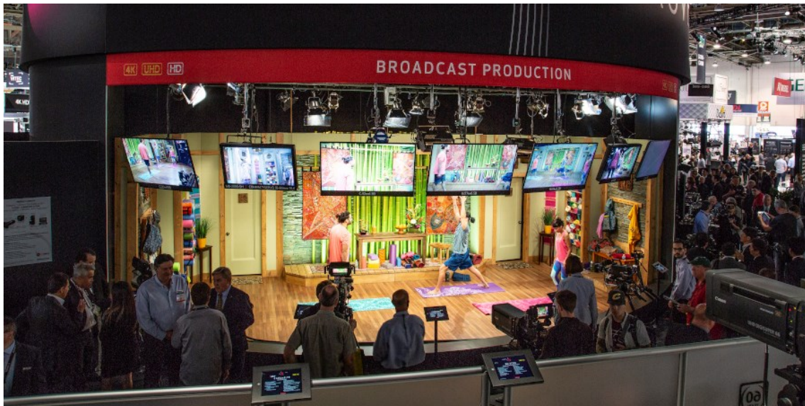
MC 2 – Canon – NAB

1) Argentina, Australia, Austria, Belgium, Brazil, Canada, Chile, China, Germany, Great Britain, Indonesia, Malaysia, Mexico, Poland, Singapore, Spain, Taiwan, Thailand, UAE