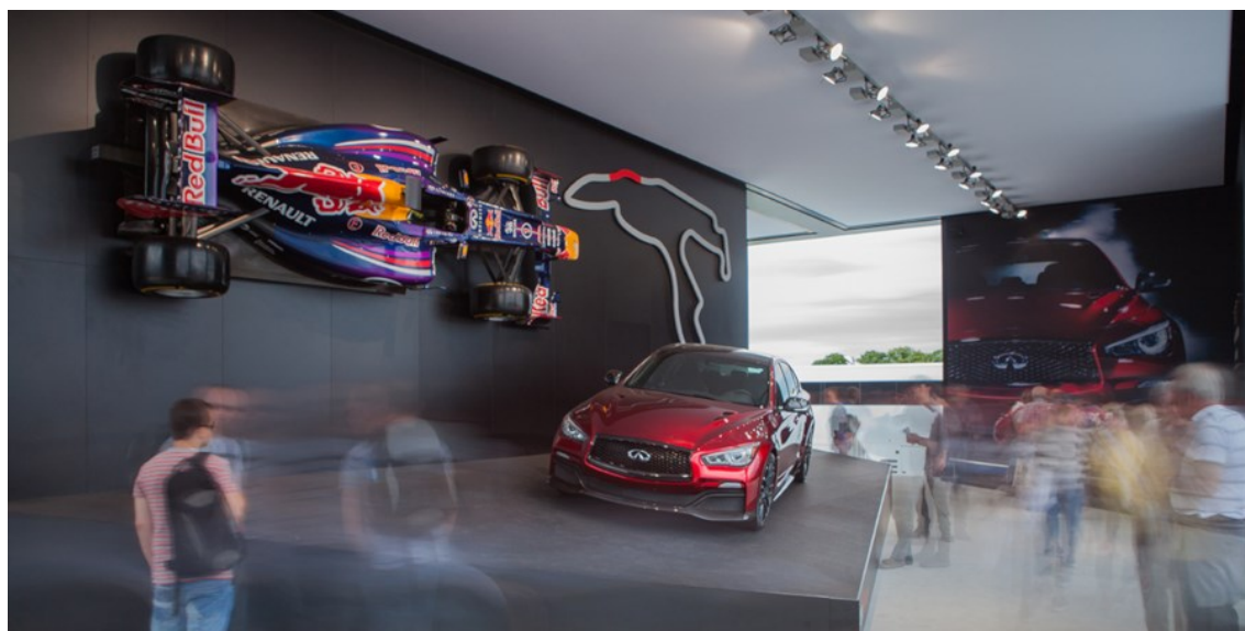
Expomobilia – Infiniti – Goodwood Festival

1) Australia, Austria, Brazil, China, Egypt, Germany, Hong Kong, India, Indonesia, Israel, Italy, Russia, Singapore, South Korea, Taiwan, UAE, USA