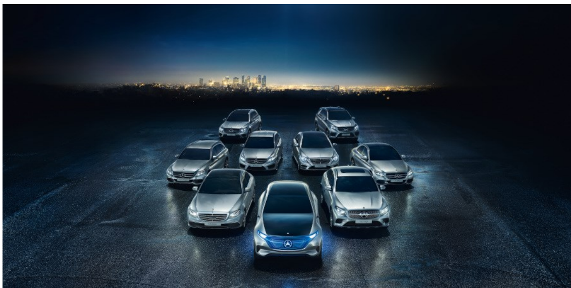
Reflection Marketing – Mercedes Benz