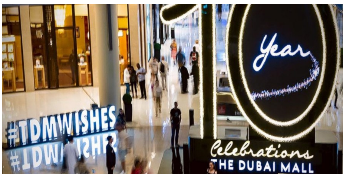
MCH Global – Dubai Mall