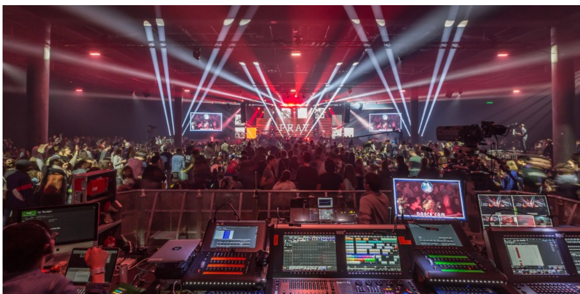
Winkler Livecom – Praise Camp

1) France, Germany, Italy, Liechtenstein, South Korea, Thailand, USA